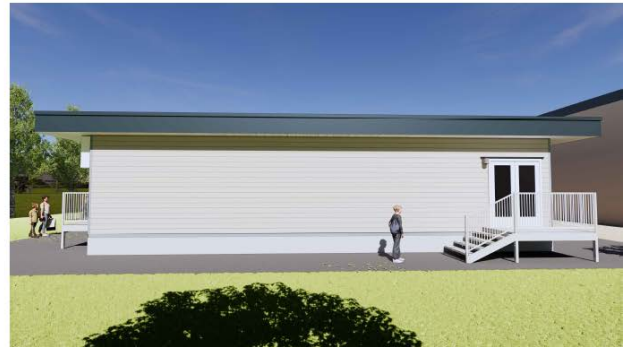
Artist's Renderings - Samuel Brighthouse Elementary Annex