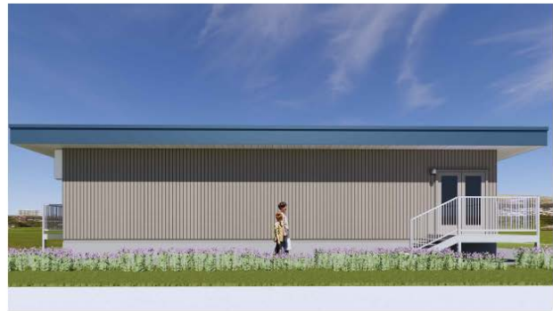
Artist's Renderings - William Cook Elementary Annex